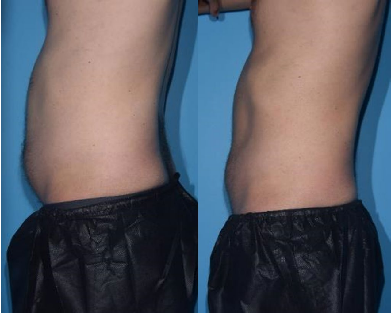
Figure 2: A digital photographs of 34-year-old male were taken at baseline (left) and 1-month follow-up (right, a 14.5% reduction of VAT).