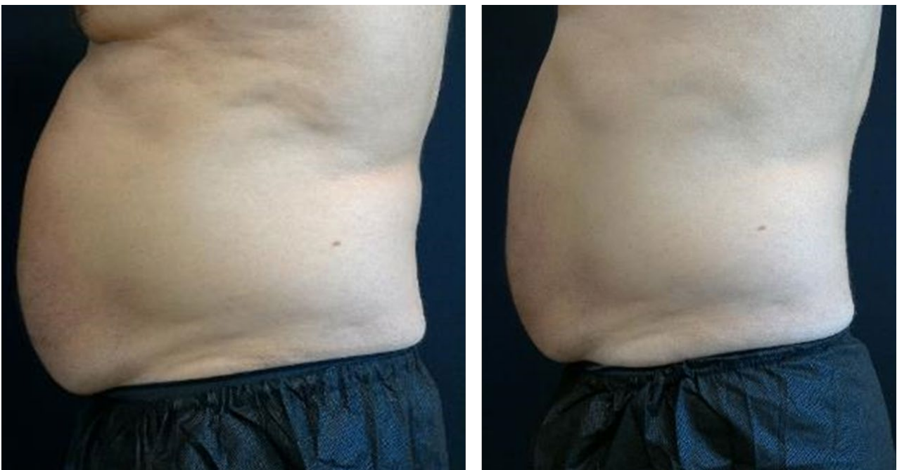
Figure 3: A digital photographs of a 57-year-old male with a BMI of 32.8kg/m 2 taken at baseline (left) and a 1-month follow-up visit (right, an average VAT reduction of 17.0%).